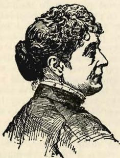
Carrie S. Harrison